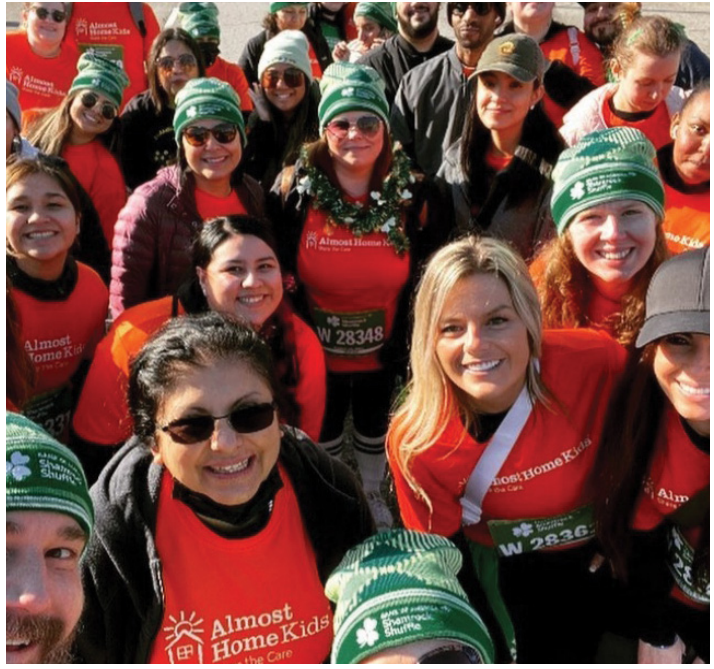
Team Rainforest, Shamrock Shuffle