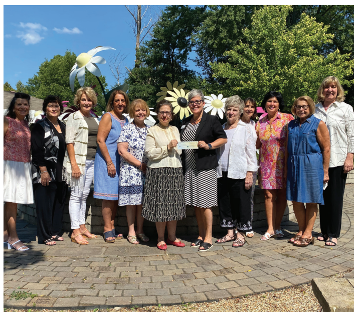
Greek Orthodox Archdiocese of America & Greek Orthodox Ladies Philoptochos Society check presentation