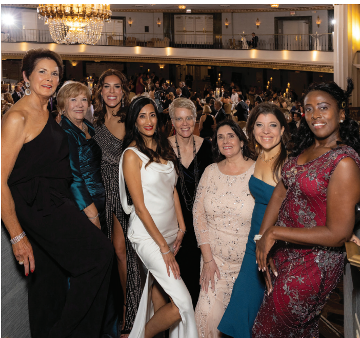
Share the Care Ball, a Glamorous Affair's fabulous gala committee