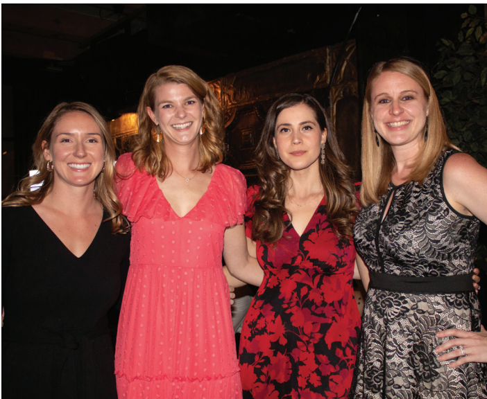
AHK Young Associates Board hosted their annual No Place Like Home fundraiser

The 2022 "Share the Care Ball, a Glamorous Affair" proved to be a night not to forget. The gala was held on October 28th with over $310,000 raised to benefit the children of AHK thanks to almost 300 very generous attendees. The historic Hotel Intercontinental was the perfect backdrop for this event which brought out all the grandeur and glitz as we were transported back to the glamorous 1920's. The evening kicked off with