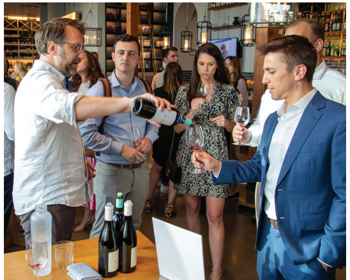
Attendees at the Tasting for a Cause event in June