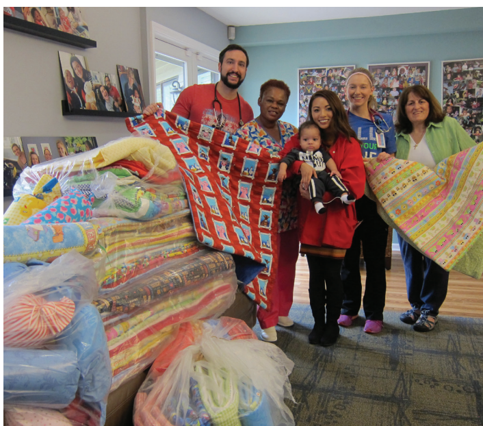
Quilt donations from St. Helen Women's Philoptochos at Saints Constantine & Helen Greek Orthodox Church in Palos Hills