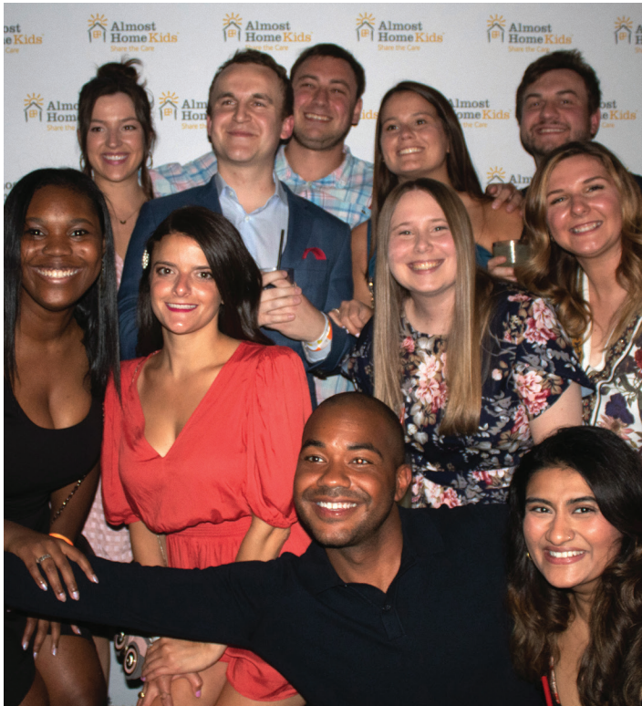
Join our Young Associates Board at their 9th Annual "No Place Like Home" Event on June 9th