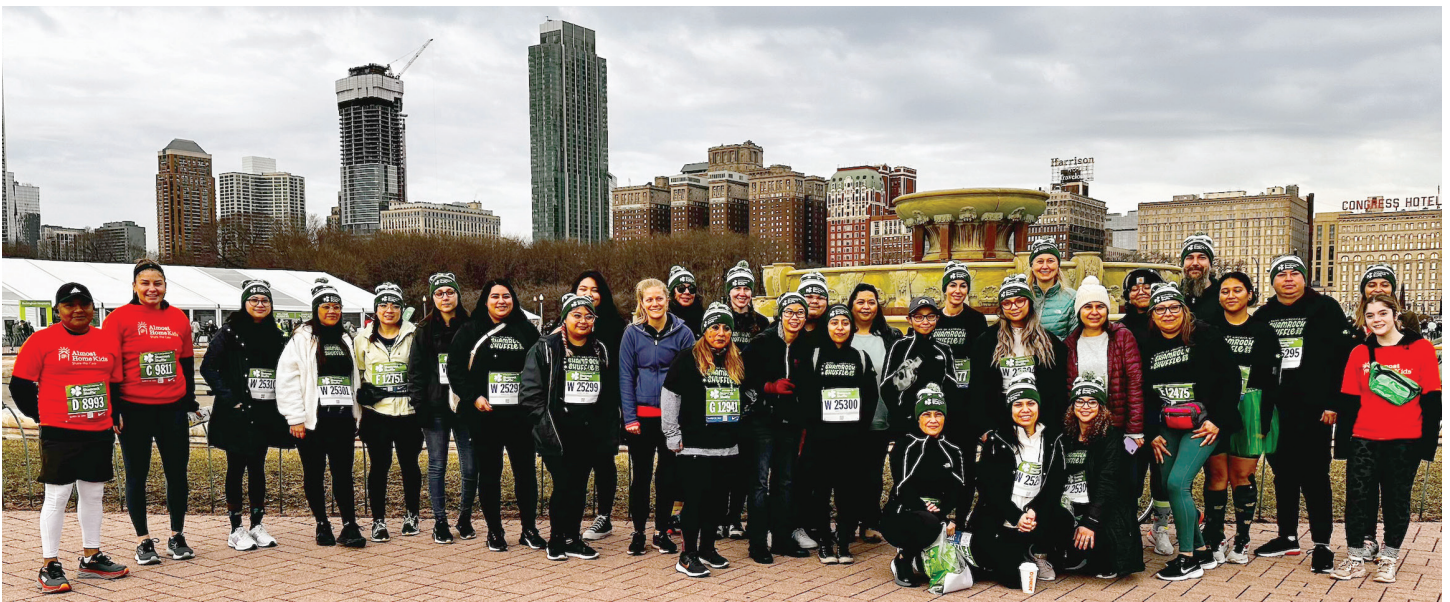
The AHK Running Team at the Bank of America Shamrock Shuffle