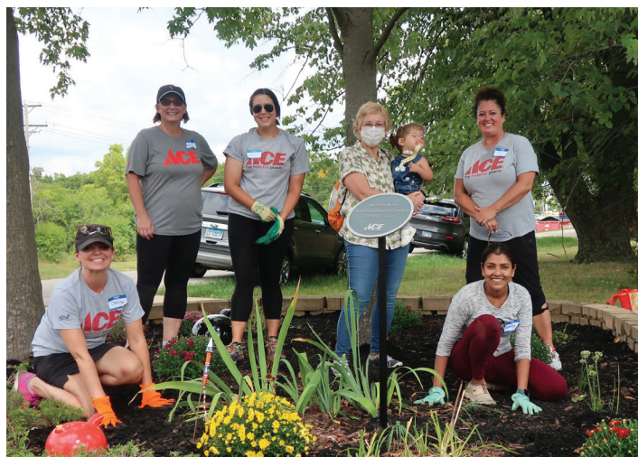
The Ace Garden Club sprucing up the gorgeous Ace Garden at AHK Naperville