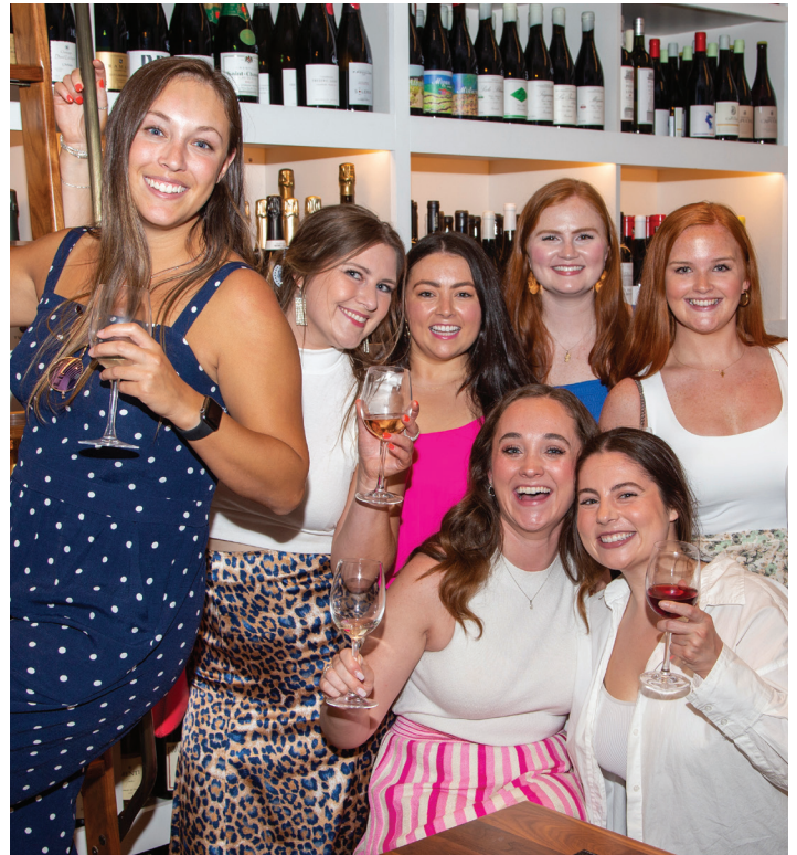
Don't miss our annual premium wine tasting event at Verve Wine + Provisions on June 27th