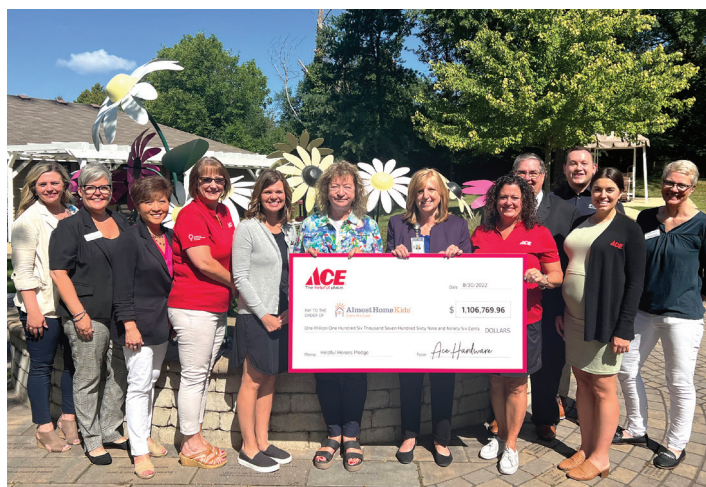
Everyone at Almost Home Kids was thrilled to accept this amazing check from the Ace Foundation