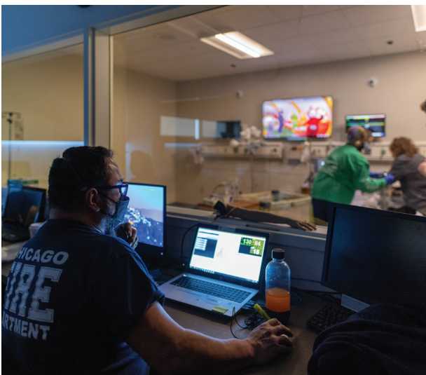
Real-time discussions, assessments and debriefs allow participants a greater understanding of the appropriate response to each scenario