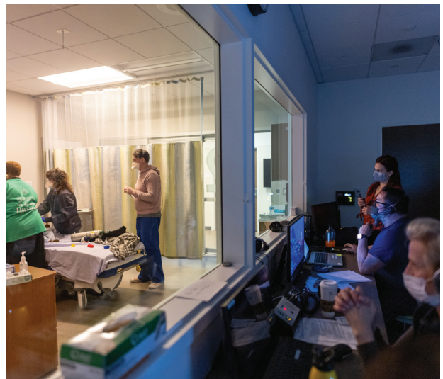
Different situations, build confidence levels and increase capabilities in vent and trach care