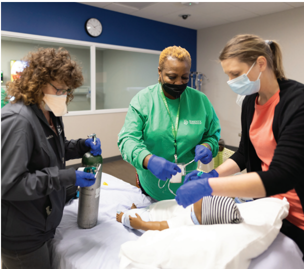
Home healthcare nurses train in a realistic simulation with scenarios developed by AHK