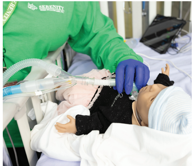
High-fidelity mannequins designed to immerse learners in realistic scenario-based exercises