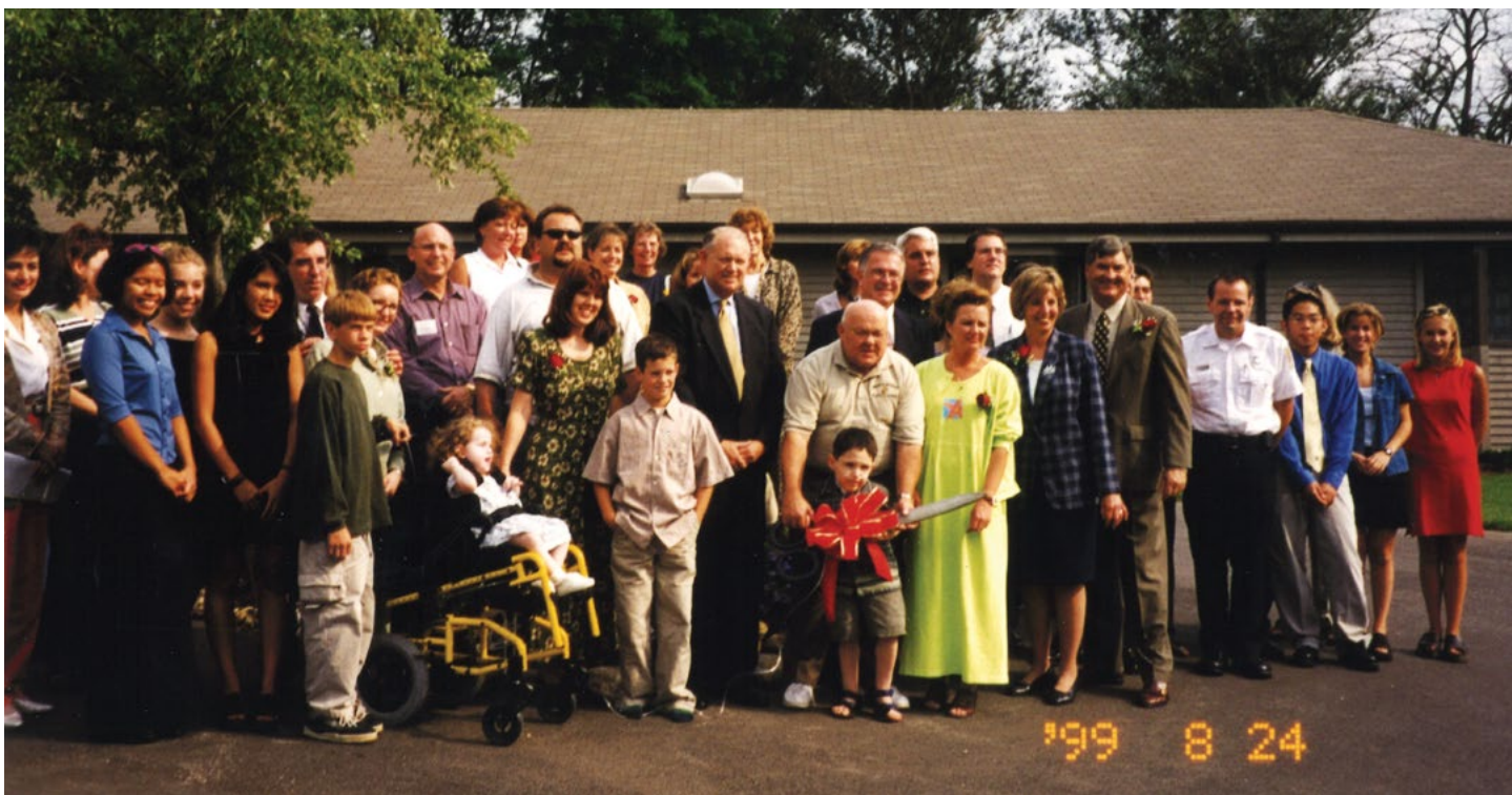
Ribbon Cutting for the 1999 Respite House Opening