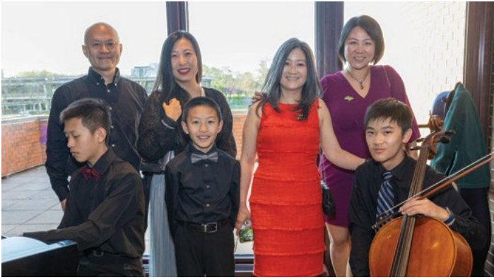
The Art for Hope Foundation musicians and their parents